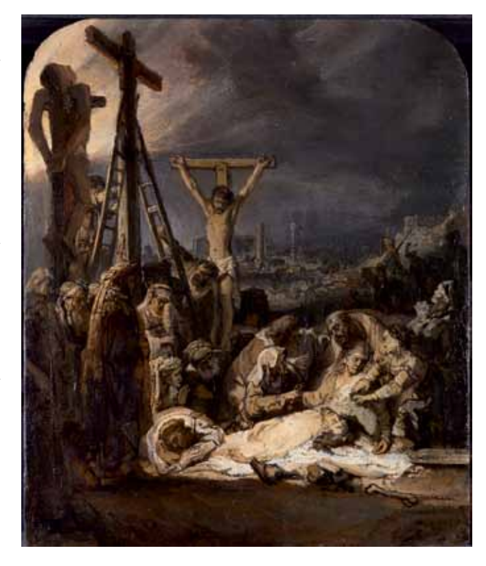
Fig. 17. Rembrandt van Rijn (Dutch, 1606–69) Lamentation over the Dead Christ , ca. 1635, oil on irregularly shaped paper and pieces of canvas stuck on oak, 31.9 × 26.7 cm (12½ × 10½ in.) London, National Gallery