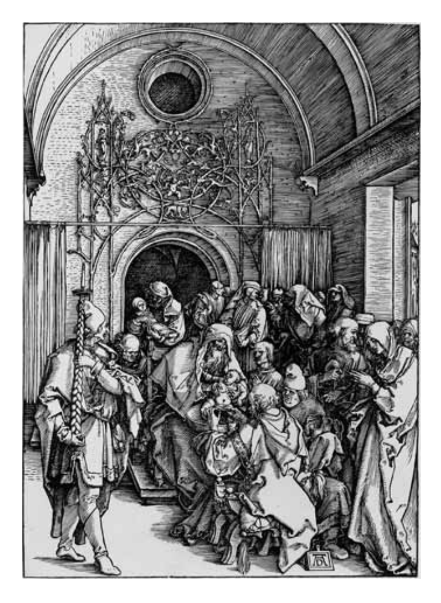
Fig. 9. Albrecht Dürer (German, 1471–1528) Circumcision , 1503–5 (published 1511), woodcut, 29.3 × 20.9 cm (11 5% × 814 in.) London, British Museum

reproductive printmaker was even less admired, producing merely the "Eccho of that Eccho," as Richardson so colorfully put it.<sup>39</sup>