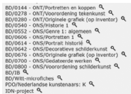
4 Box numbers/location of photographs, works by Thomas de Keyser, Rijksbureau voor Kunsthistorische Documentatie, The Hague