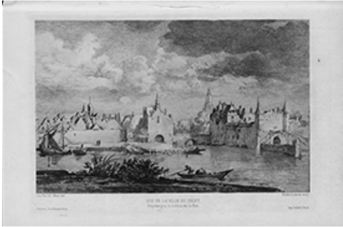
1 Maxime Lalanne after Jan Vermeer, View of Delft from the South , in: Gazette des Beaux-Arts , vol. 21 (1866), between pp. 298 and 299