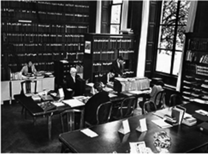
3 Study room, Rijksbureau voor Kunsthistorische Documentatie, former location Korte Vijverberg, The Hague, 1965

Of course I, too, wore thin my Eurailpass viewing originals. But my work at the RKD tracing iconography and style was comfortable and civilized—tea was even brought to the drawings archive at 3:30 every afternoon. So while I worked in comfort, the system by which the photographs were ordered struck me as strange. Photographs of drawings were on the first floor, separated from photographs of paintings on the ground floor. Portraits were located in the Beelddocumentatie Portreticonografie (Iconografisch Bureau), a completely different department in the back of the building. Moreover—what puzzled me most about the ordering system—within each of these departments, boxes were filed on the shelves by iconographic subject, the number of whose subdivisions are staggering. Each genre—history, history painting, landscape, still-lives, genre painting, and portraiture—were again broken down, either by time period, or by a set of ‘stylistic schools’ that sometimes included separate categories for artists who are not always considered major figures today. (These individual categories appear to have been derived from a nineteenth-century taste for painters influenced by Italian art, and for the fine handling of paint, to which I return, below). The works of my artist, Thomas de Keyser, were—and still are—spread over boxes in no less than twelve different subject areas (fig. 4).