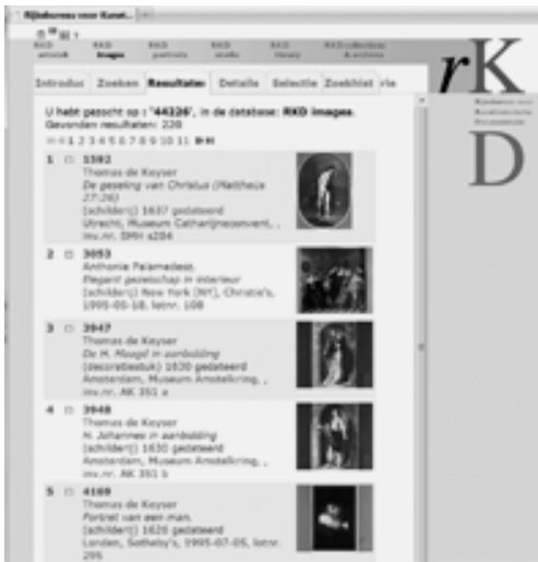
6 Rijksbureau voor Kunsthistorische Documentatie, on-line database, http://website.rkd.nl/Databases/RKDartists , search result Thomas de Keyser

began a process resulting in a boon for art historians seeking relief from outrageous reproduction fees for scholarly publications. 31 But we are all aware that the black and white photograph conveys a limited amount of information, foregrounding specific qualities of painting in favour of others. In so doing, the photograph has shaped and perpetuated definitions of artistic style in ‘idea’ conveyed by outline and tone—gradations of light and shade—first articulated in the Italian Renaissance. Only in the last forty years have the chemistry of paint composition and application techniques begun to figure prominently in connoisseurship decisions, such as those made from the early 1970s by the Rembrandt Research Project. For these, the photographic—and now digital—representations of the x-ray, ultra-violet light reflectography, autoradiographs, and paint samples viewed through high-powered microscopes are invaluable. 32 But until their systematic use and widespread circulation, Renaissance concepts of style as subject, outline, and tone will continue—if only subliminally—to shape our field.