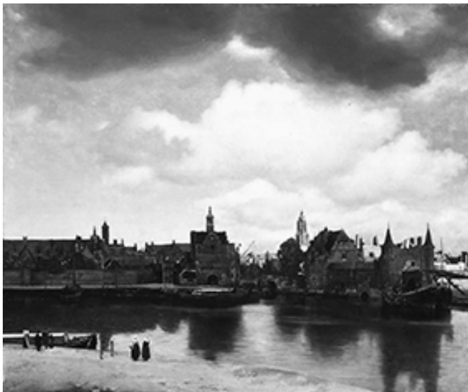
2 Jan Vermeer, View of Delft from the South , Koninklijk Kabinet von Schilderijen, Mauritshuis, The Hague

after, art lovers began to pour over photographs of paintings themselves. The minutes of the meeting on 26 January 1863 of the recently founded Koninklijk Oudheidkundig Genootschap, Amsterdam, recorded that members examined “a few photographs after old and new paintings”. 5 By 1901, W. Martin Conway recommended that connoisseurs form photographic collections for study, and envisioned in some detail a comprehensive institutional collection of photographs that would create, in the words of his page headings, “A Museum of Photographs” that recorded the history of art. 6